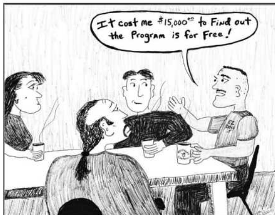
Heard It In a Meeting: Each One Teach One

Tradition 6: "An NA group ought never endorse, finance, or lend the NA name to any related facility or outside enterprise, lest problems of money, property, or prestige divert us from our primary purpose."