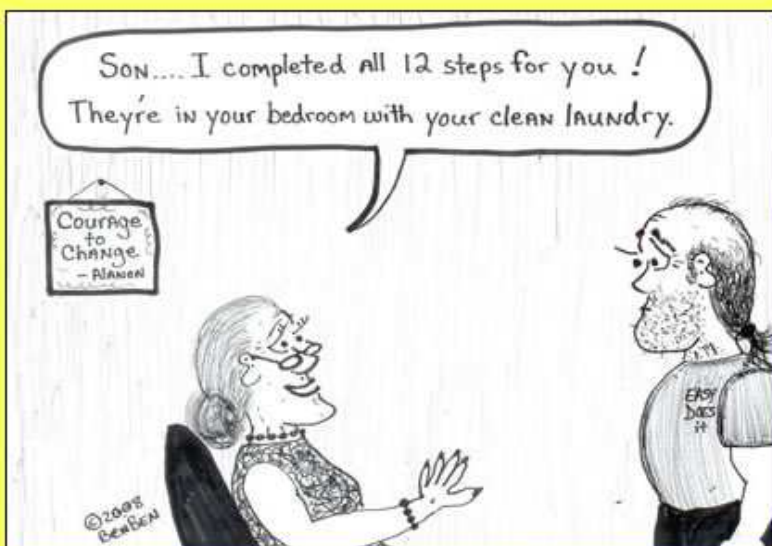
Completed for you