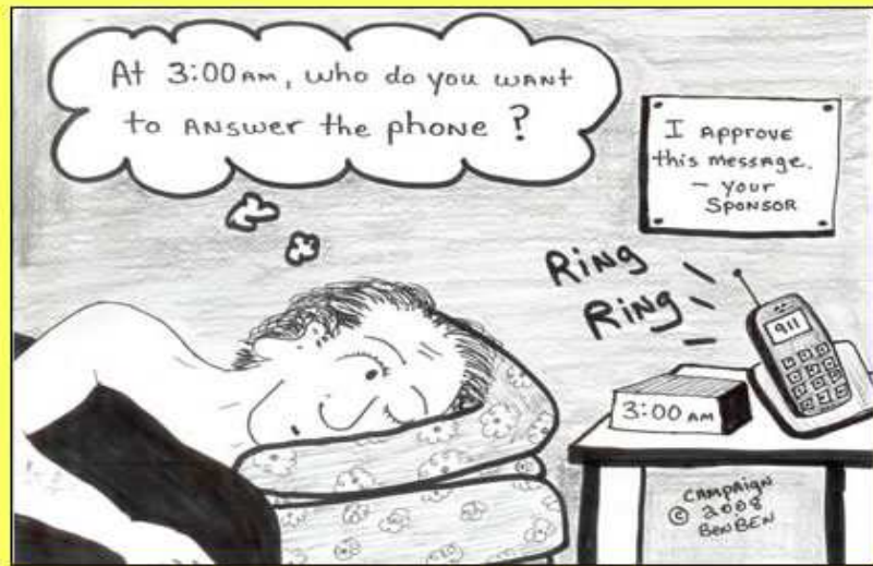
3 am phone call

THE ALCOHOLIC SAYS, "I'D LIKE TO SCREW HER!" THE ADDICT SAYS, "OUT OF WHAT?"