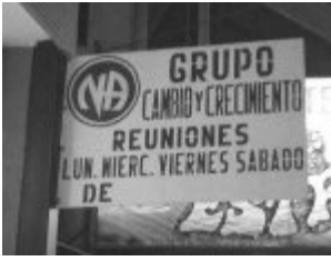
The actual sign outside of the meeting place

Por primera vez en la historia, existe a disposición de todos nosotros un sencillo programa espiritual —no religioso— llamado Narcóticos Anónimos, que ha entrado en la vida de muchos adictos (Sí, nos Recuperamos)